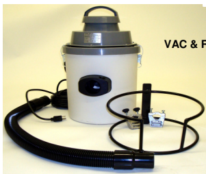
VAC & RACK