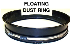
FLOATING DUST RING